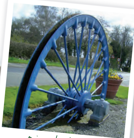
Pit wheel from Bagworth Colliery