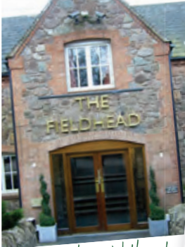
The Fieldhead Hotel