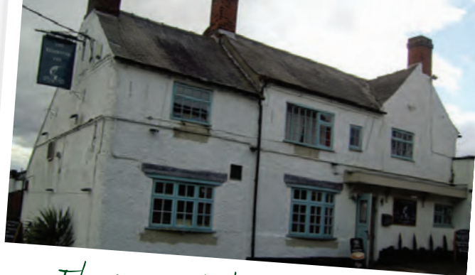
The Reservoir Inn, Thornton

Severn Trent Water granted public access to the reservoir and surrounding land for recreational purposes. Popular with walkers, anglers and bird watchers, this refuge for a diversity of wildlife was designated as a Local Wildlife Site in 2005.