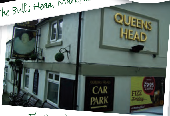
The Queen's Head, Markfield