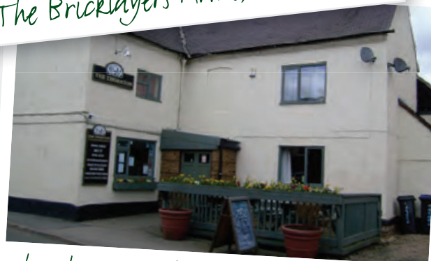
The Thornton (Thornton & District WMC)

children's play equipment. Patrons can gain access from the garden to a pathway that circumnavigates Thornton Reservoir. Real ales available were Everards Tiger, Sunchaser & Ascalon.