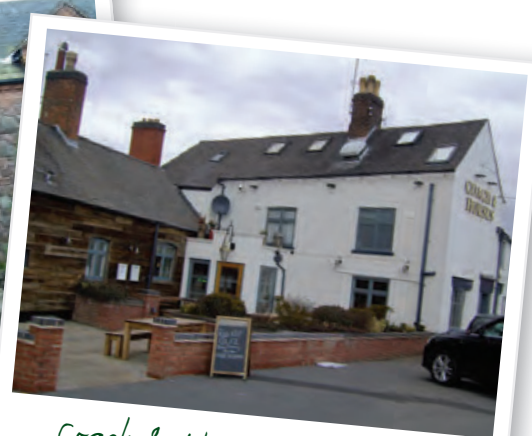
Coach & Horses, Field Head

The Queen's Head is an archetypal village locals' watering hole, another Marston's house reliant solely on wet trade. Entering the front door took me directly into the traditional public bar with its exposed black ceiling timbers and quarry tile floor. To my left was an area, with no servery, more akin to a lounge bar that, in turn, had a snug annex. To the rear was a partially covered and heated block-paved courtyard with picnic tables and a shelter dedicated to smokers' needs. Further picnic tables adorned the large lawned garden that lay beyond. Marston's Burton Bitter & Pedigree were on offer.