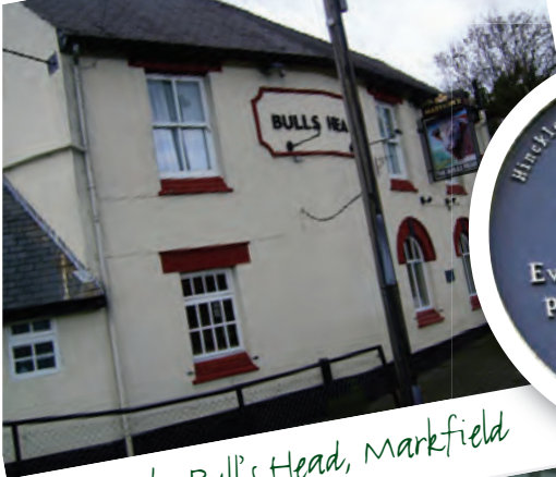
The Bull's Head, Markfield