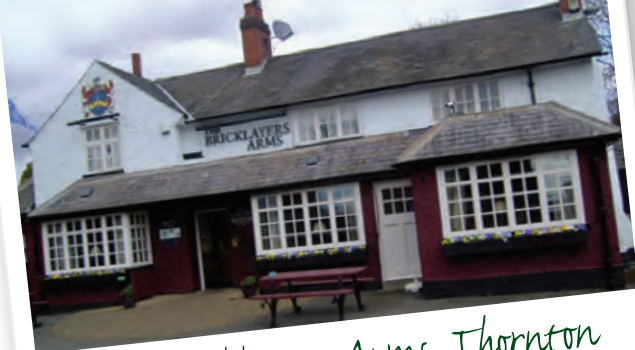
The Bricklayers Arms, Thornton